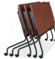
TRAINING TABLE 48" $55 PER MONTH (ACTUAL PRODUCT SIMILAR)

ADDITIONAL SIZES AVAILABLE: 60" LENGTH: $60 PER MONTH 72" LENGTH: $65 PER MONTH