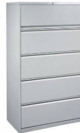
LATERAL 5 DRAWER: $68 PER MONTH