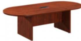
CONFERENCE TABLE 8' $85 PER MONTH

ADDITIONAL SIZES AVAILABLE: 8' LENGTH: $45 PER MONTH 10' LENGTH: $100 PER MONTH 12' LENGTH: $135 PER MONTH