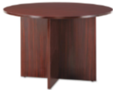
ROUND CONFERENCE TABLE 42" $35 PER MONTH

ADDITIONAL SIZES AVAILABLE: 36" ROUND: $30 PER MONTH 48" ROUND: $40 PER MONTH