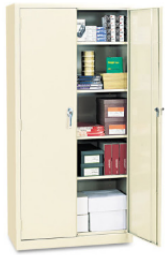
72" STORAGE CABINET: $40 PER MONTH

ADDITIONAL SIZES: 48" STORAGE CABINET: $35 PER MONTH