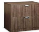
LATERAL 2 DRAWER WOODEN FILE