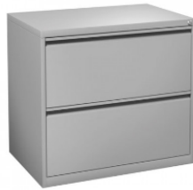
LATERAL 2 DRAWER: $50 PER MONTH

ADDITIONAL SIZES: 48" STORAGE CABINET: $35 PER MONTH