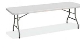
FOLDING TABLES (ANY SIZE) $20 PER MONTH

ADDITIONAL SIZES AVAILABLE: 60" LENGTH: $60 PER MONTH 72" LENGTH: $65 PER MONTH