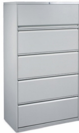
LATERAL 5 DRAWER: $56 PER MONTH