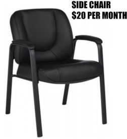
SIDE CHAIR $20 PER MONTH