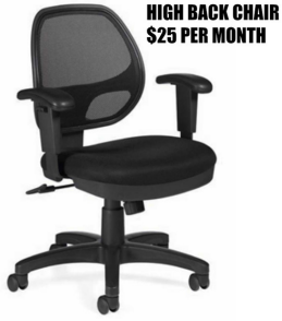
HIGH BACK CHAIR $25 PER MONTH