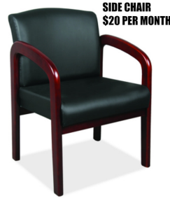
SIDE CHAIR $20 PER MONTH