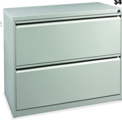
LATERAL 2 DRAWER: $40 PER MONTH

ADDITIONAL SIZES: 48" STORAGE CABINET: $25 PER MONTH