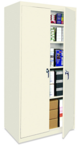
72 STORAGE CABINET: $30 PER MONTH

ADDITIONAL SIZES: 48" STORAGE CABINET: $25 PER MONTH