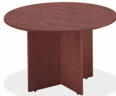
ROUND CONFERENCE TABLE 42": $26 PER MONTH

COLORS AVAILABLE: CHERRY MAHOGANY ESPRESSO