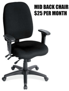
MID BACK CHAIR $25 PER MONTH

As the renter of our furniture, you assume all responsibility for the furniture and must provide adequate insurance to cover all furniture in your possession during the duration of your rental program with PVI Office Furniture Plus.